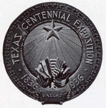
Published by the Texas Centennial Exposition, Dallas, Texas.

None of the matter printed in Centennial News is copyrighted and publications desiring to use any material herein are invited to do so.