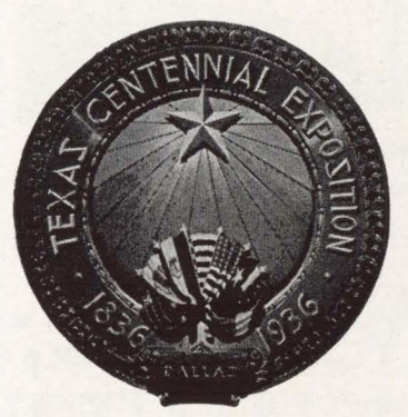
Published by the Texas Centennial Exposition, Dallas, Texas.

None of the matter printed in Cen-tennial News is copyrighted and publi-cations desiring to use any material herein are invited to do so.